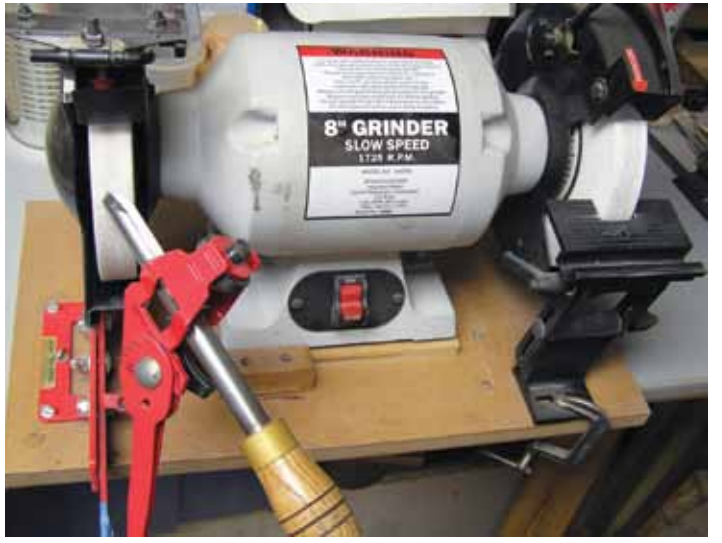
For everyday sharpening, many woodturners rely on a slow-speed grinder with two 8" × 1" white aluminum oxide wheels. On Jim Echter's machine, the left wheel has a TruGrind jig for sharpening gouges, skews, and parting tools. The right has a Veritas adjustable-angle platform for sharpening scrapers.