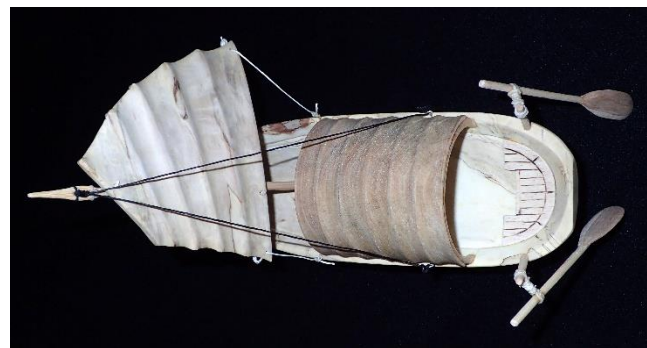
Ralph Watts - Sampan-hollow form