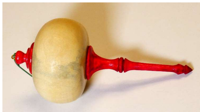
Michael Jackson - Ornament