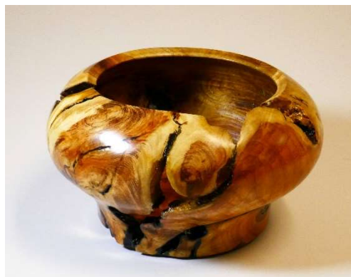
Taz Bramlette - Honey Locust Root Vessel