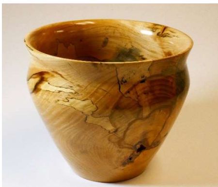
Drake Ward - Black Cherry Bowl