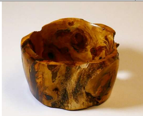
Drake Ward - Cottonwood Bowl