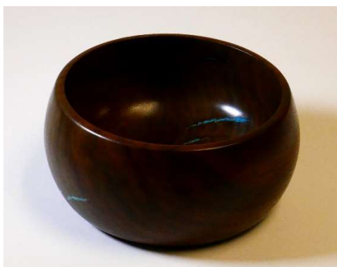
Ray Berry - Walnut Bowl with Turquoise