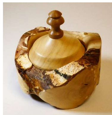
Jim Breeden - Beech, Walnut, Box Elder Lidded Box