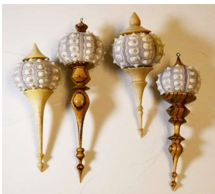
Bill Kalb - Sea Urchin Ornaments