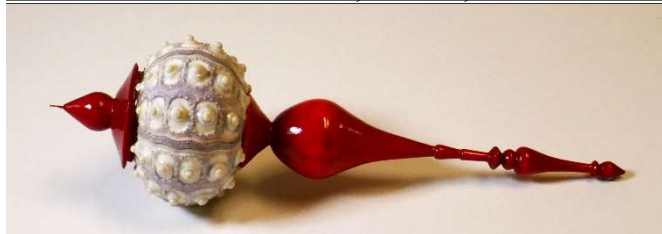
Bill Kalb - Sea Urchin Ornament