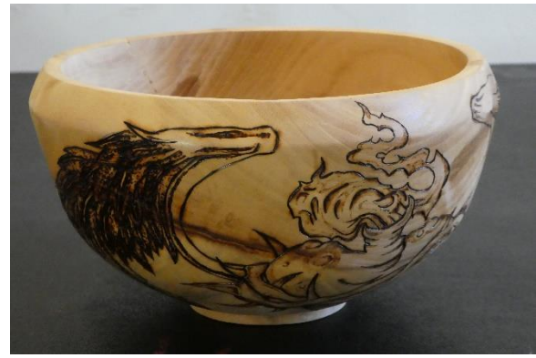
3. Ed Otero - Cottonwood Bowl B with Pyrography