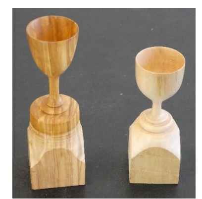
1. Bill Kalb - Olive and Sycamore Goblets

The photographer will only be available until 9:25 A.M. on the day of the meeting to take photos of the instant gallery items.