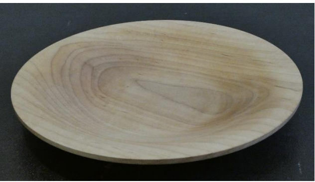
18. Hy Tran - Maple Platter