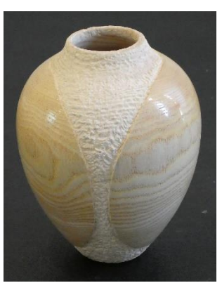
9. Larry Linford - Hackberry Textured Vase