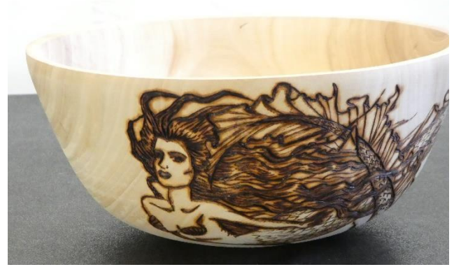
2. Ed Otero - Cottonwood Bowl A with Pyrography