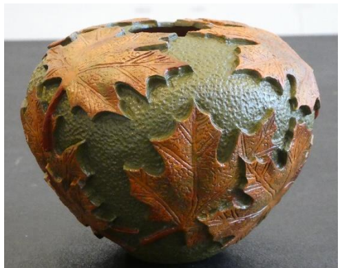
6. Alan Becker - Mystery Wood Carved Hollow Form

5. Alan Becker - Mystery Wood Carved Hollow Form