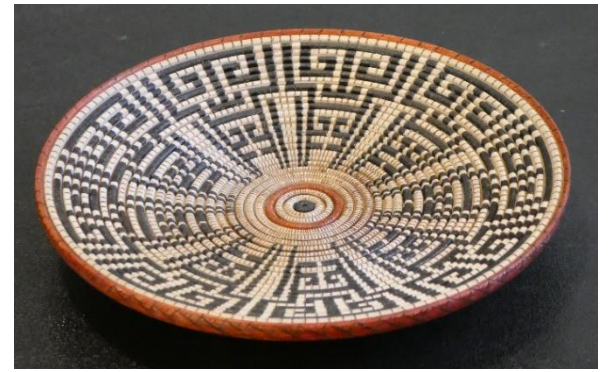
10. Larry Linford - Maple Basket Illusion