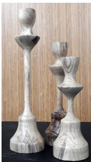
Bob Rocheleau - Chestnut candlesticks

The photographer will only be available until 9:25 A.M. on the day of the meeting to take photos of the instant gallery items.