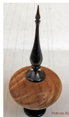
Patricia Apt - Maple_Blackwood Miniature Box