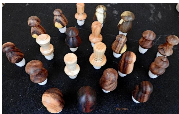
Hy Tran - Bottlestoppers