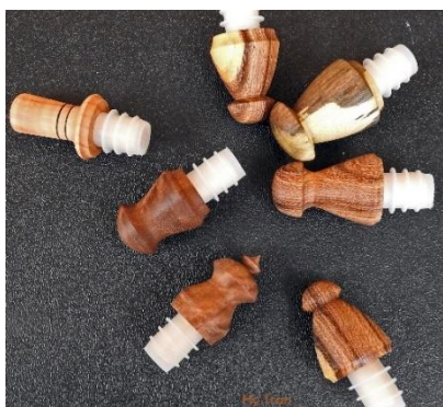
Hy Tran - Mixed Woods Bottle stoppers