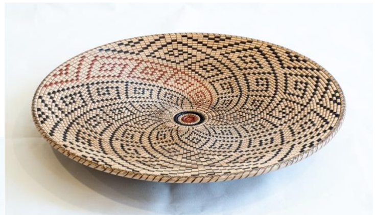
Maple Basket Illusion Platter by Larry Linford