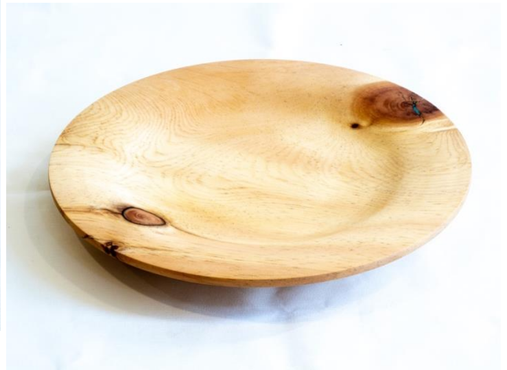
Bristle Cone Pine Platter by Hy Tran