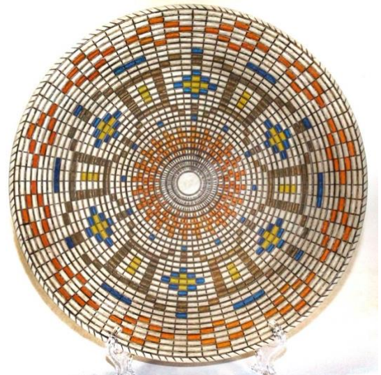
Maple basket illusion piece turned in March by Tom Durgin