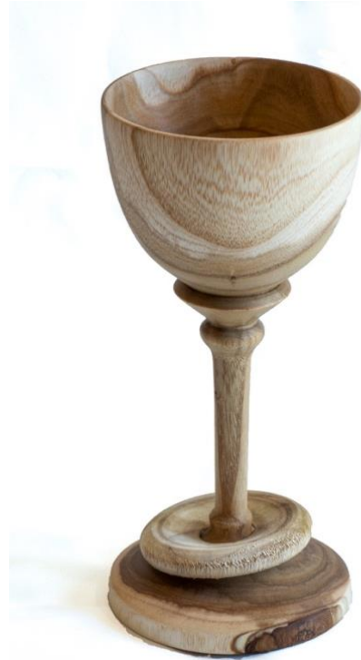
Apply Goblet with captured ring by Greg Fryweaver