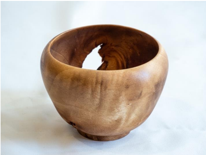
Cottonwood vessel with natural void by Greg Fryweaver