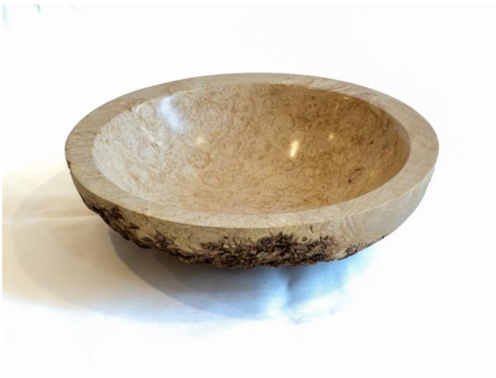
Box Elder Burl Natural Edge Bowl by Brad Carvey