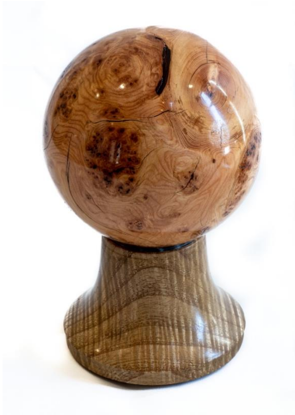
Pine Burl Sphere with Curly Catalpa Stand by Brad Carvey