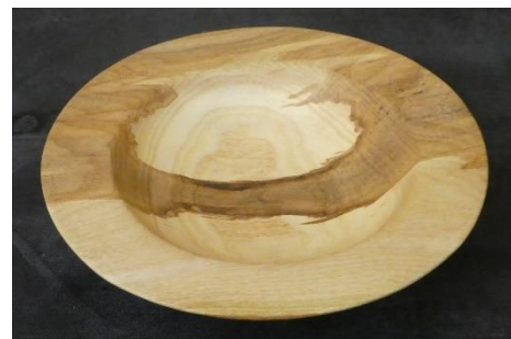
8. Ash bowl by Chuck Dowdy