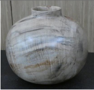
1. Silver leaf maple hollow form by Bill Killough