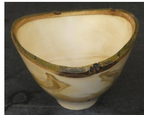
6. White fir natural edge bowl by Bill Mantelli