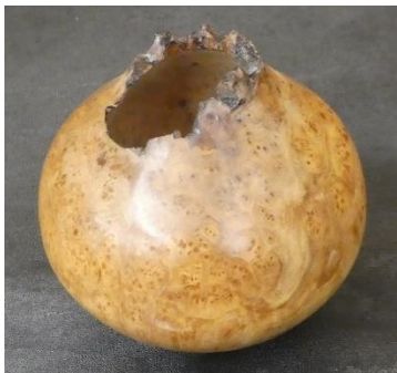
10. Natural edge maple burl hollow form by Ray Berry