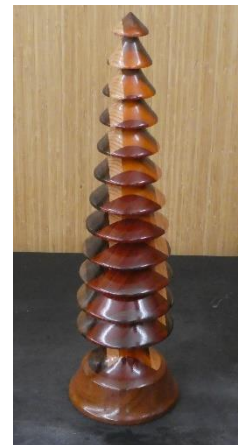
7. Segmented novelty tree of padauk, orange heart, walnut, oak and kiati by Jammie Wheland