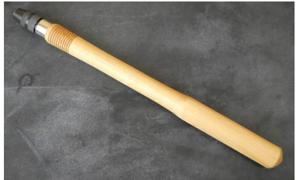
14. Birch tool handle by Bill Kalb