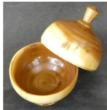
15. Inside detail of cherry covered dish by Bill Kalb