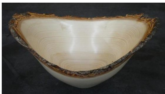
17. White fir natural edge bowl by Tim Kelly