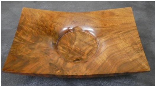
2. Walnut rectangular tray by Bill Mantelli