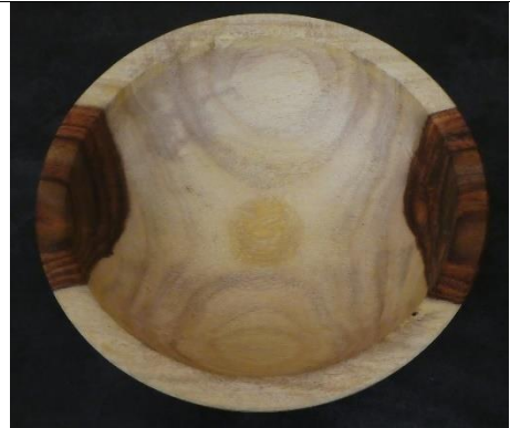
5. Indian rosewood 10 inch bowl