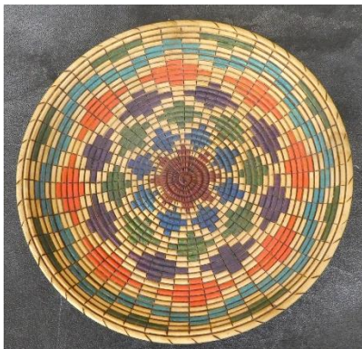
12. Poplar basket illusion by Tom Durgin