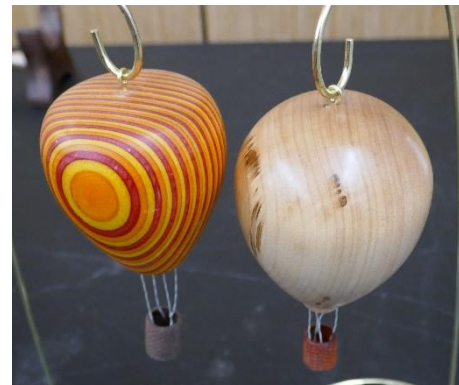
Don Roden - Spectrawood and Cherry Ballon Ornaments