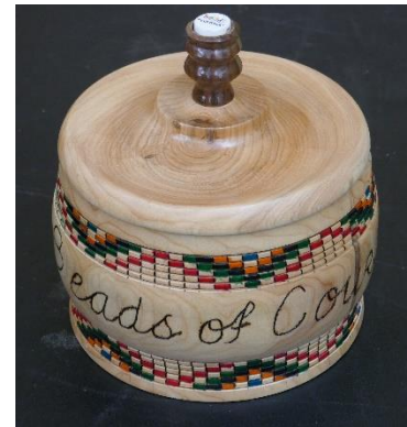
Bob Rocheleau - Cottonwood Beads of Courage