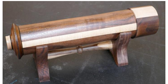
Don Roden - Kaleidoscope