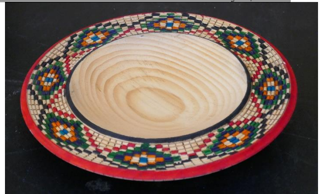
Bob Rocheleau - Cottonwood Beaded Platter

The photographer will only be available until 9:25 A.M. on the day of the meeting to take photos of the instant gallery items.