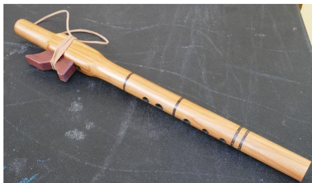
Roy Chamber - Redwood Flute