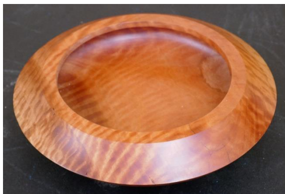
Taz Bramlette - Mystery Wood Hollowform