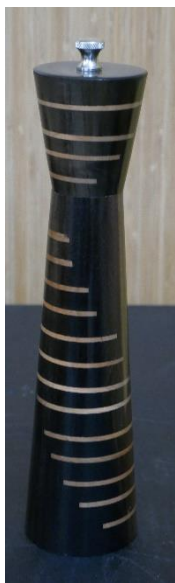
Drake Ward - Walnut Pepper Mill