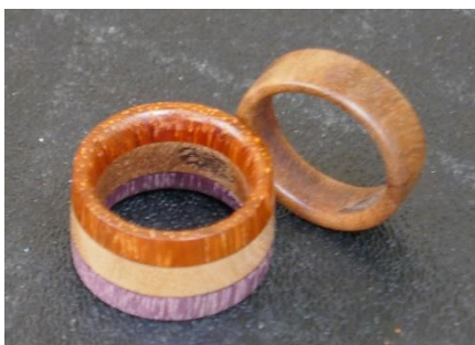
Ian A - Catalpa Eucalyptus Paduk Pupleheart Rings