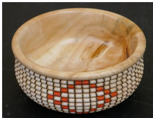
Scott Eckstein - Basket Illusion Balsam Poplar Bowl