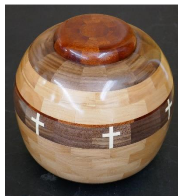
Ray Davis - Walnut Ash Bloodwood Maple Urn