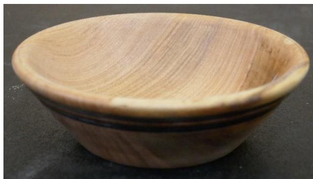
Roger Umber - Maple Bowl